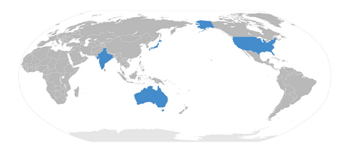
Figure 2: Asian Arc of Democracy

Canberra and New Delhi had participated earlier also in multilateral maritime exercises including Malabar exercises in 2007 and Milan exercise in 2012. Malabar exercise began in 1993 with United States and India but was suspended when India had nuclear tests in 1998 and was resumed in 2002. In 2007, Australia too participated in but withdrew from further exercises after China expressed its anguish over the US led and China containment policy under President Barack Obama's "Asia Pivot" doctrine. India too refused Australia's invitation of annual naval exercise Kakadu. Australia also withdrew from Quadrilateral Security Dialogue in 2007 consisting of United States, India, Australia and Japan which was intended to establish "Asian arc of democracy". (Figure 2) It later ceased to exist.