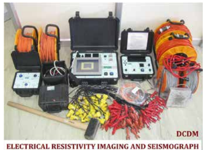
ELECTRICAL RESISTIVITY IMAGING AND SEISMOGRAPH