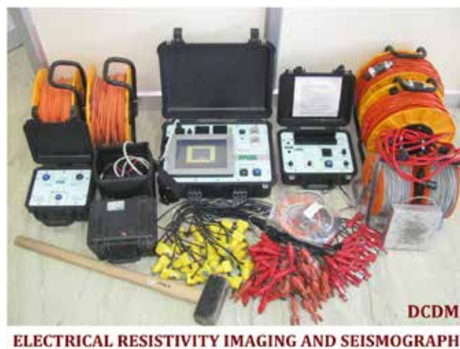
ELECTRICAL RESISTIVITY IMAGING AND SEISMOGRAPH