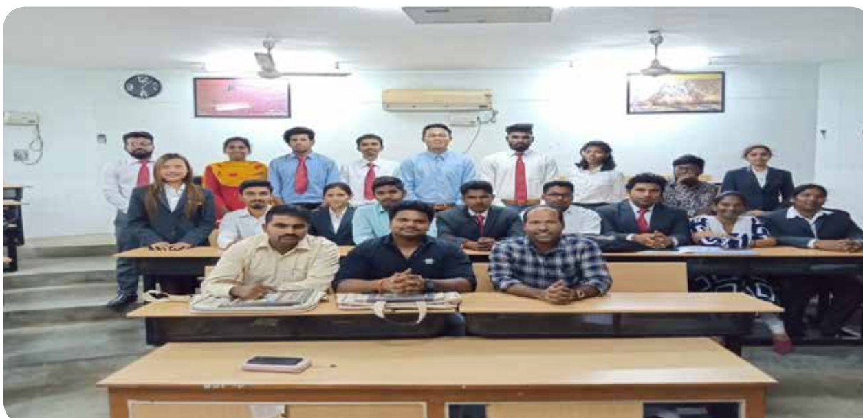
On- Campus Placement