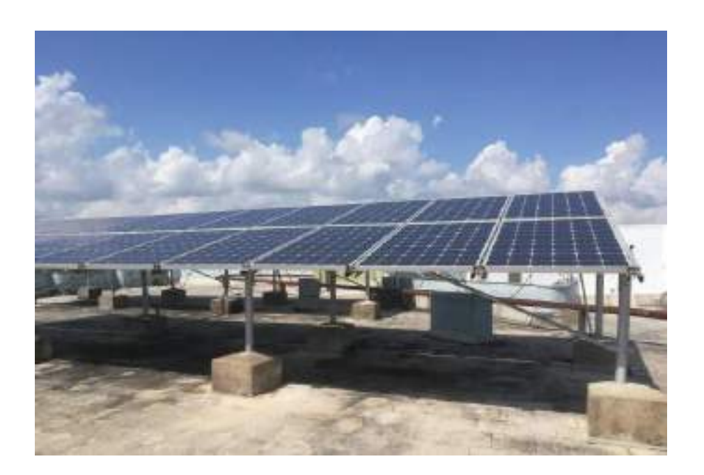
Installed solar photovoltaic in Green Energy building of Pondicherry University