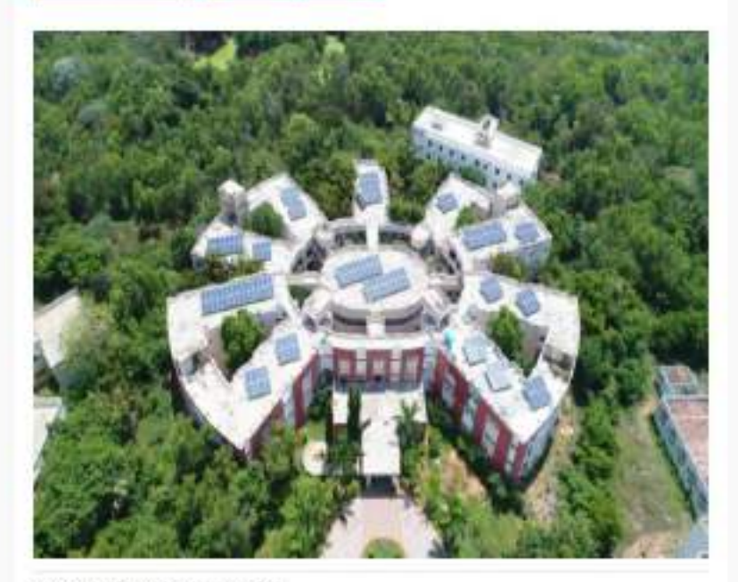
Solar plant at Pondicherry University Amp Energy India