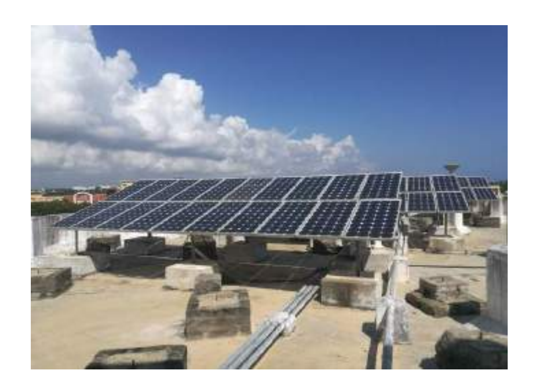
Installed solar photovoltaic in UMISARC building of Pondicherry University