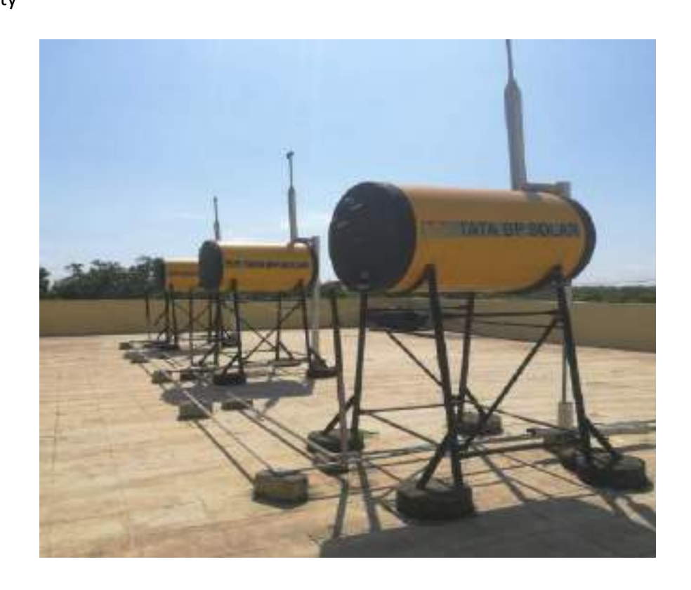
Installed solar water heaters in one of the Hostel building of Pondicherry University.