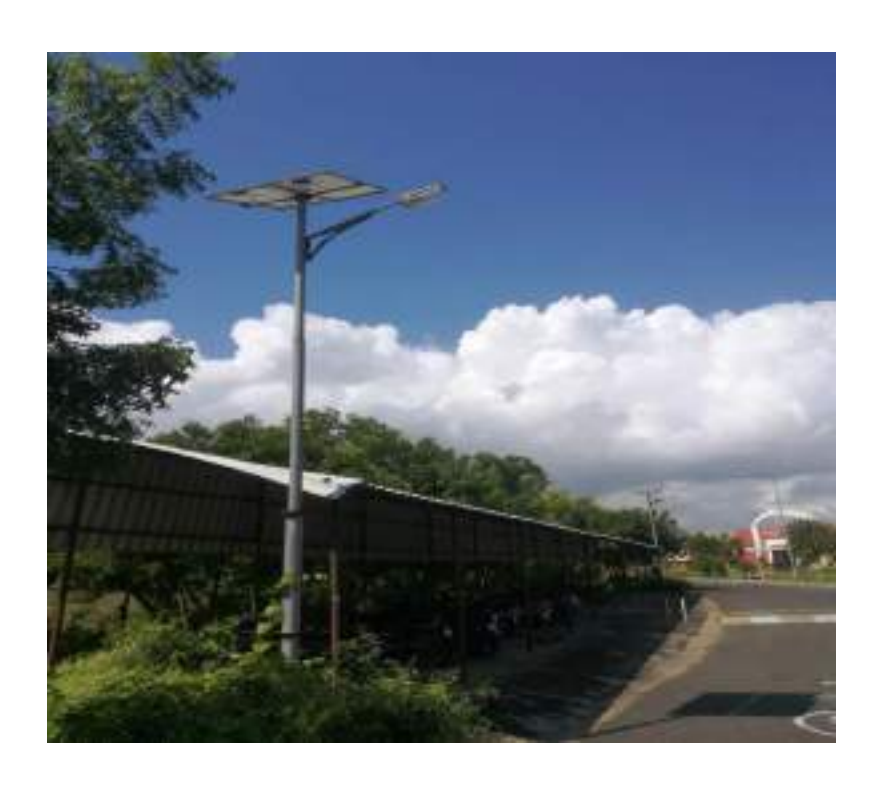
Installed solar photovoltaic street light in SilverJubilee Campus of Pondicherry University