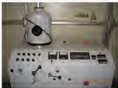
Electron Beam Deposition unit (Hindhivac)